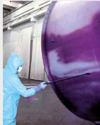
Application of Antox® spray pickling agent