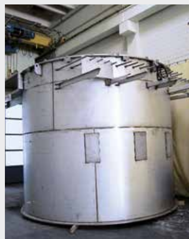
Before: tank with annealing colors