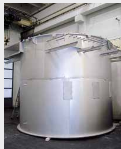
After treatment with Antox®: clean tank