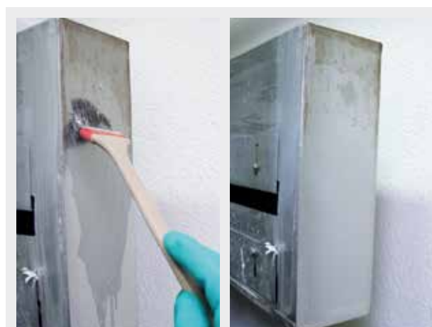
Treatment with Antox® of a rust spotted stainless steel surface