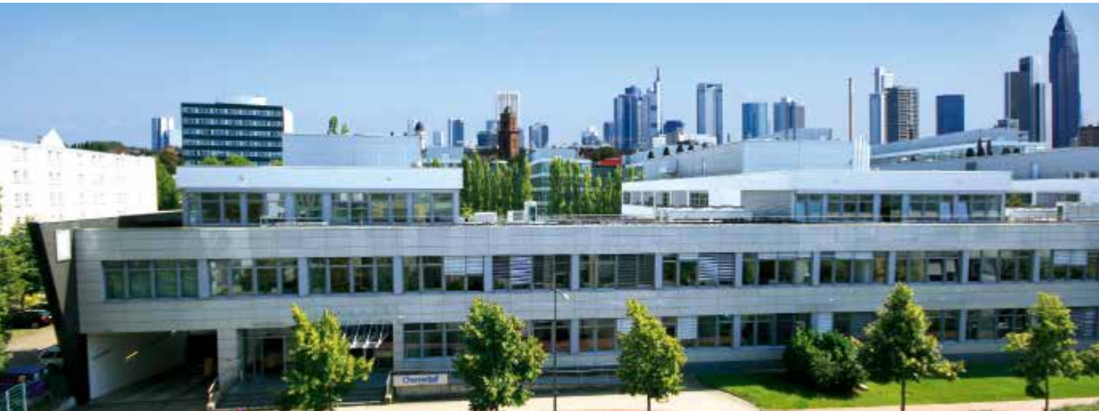
Chemetall Company Seat: Frankfurt am Main