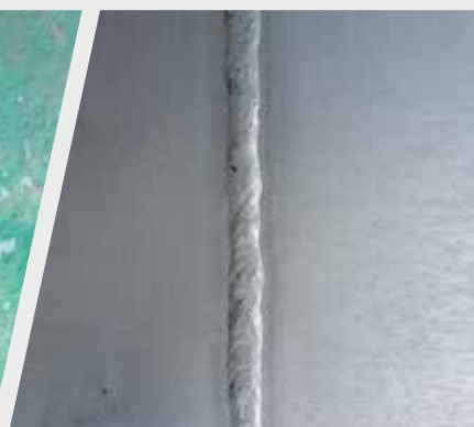
After treatment with Antox®