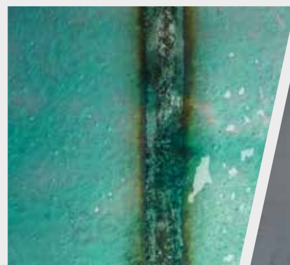
Green spray pickling agent applied to test panel