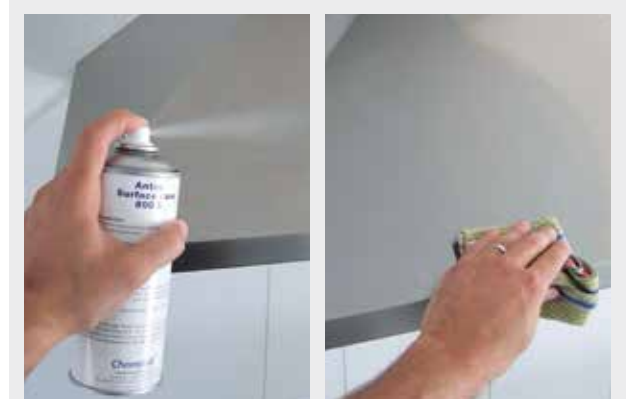
Easy to apply: spray, remove with a cloth – done.